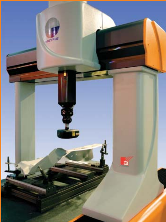
Metris C3 V featuring Cross Scanner XC50-LS